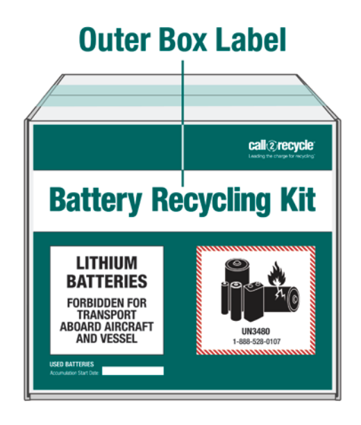
Battery Recycling Steps

Toyota has partnered with Call2Recycle to support dealers with a FREE OF CHARGE recycling method for the 12 Volt Lithium Ion battery replaced under this campaign (28800-WAA13). Replaced batteries will be shipped in compliance with DOT and EPA regulations and responsibly recycled through the Call2Recycle program. There is NO CHARGE TO DEALERS at any point during this recycling/shipping process.